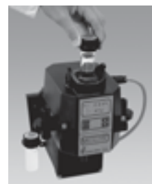
*figure 2 Easy Calibration