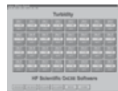
HF Online software

Keeps the optical chamber clean in finished or raw water applications.