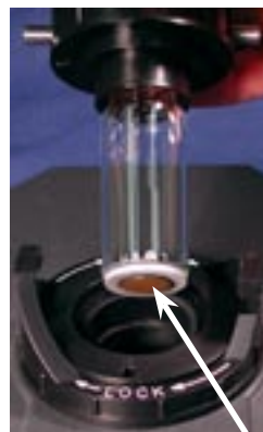
Ultrasonic Cleaning System

Keeps the optical chamber clean in finished or raw water applications.